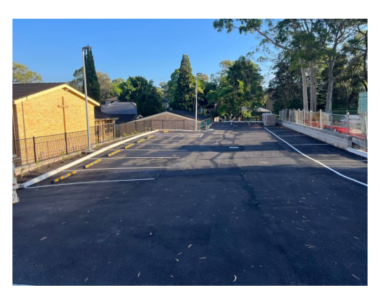
Above: the new parish carpark which will soon be available for use.

Right: the first of the new Group Homes under construction.